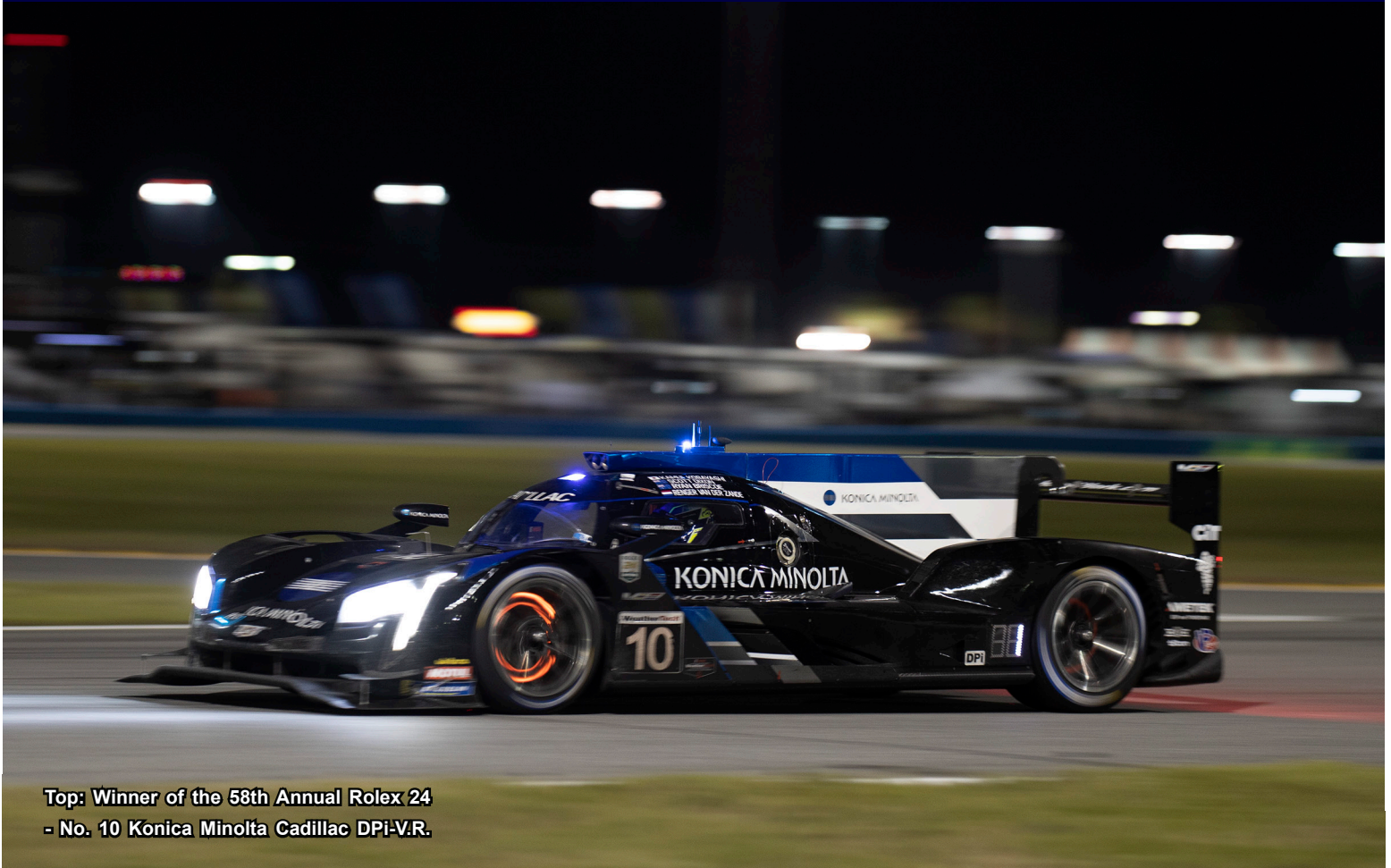
Top: Winner of the 58th Annual Rolex 24 - No. 10 Konica Minolta Cadillac DPi-V.R.

D aytona Beach, FL – January 26th, 2020 – The No. 10 Konica Minolta Cadillac DPi-V.R. dominantly won the 58th Rolex 24 at Daytona by one minute and five seconds over the No. 77 Mazda. They shattered the previous distance record by completing 833 laps for a total of 2,965.5 miles.