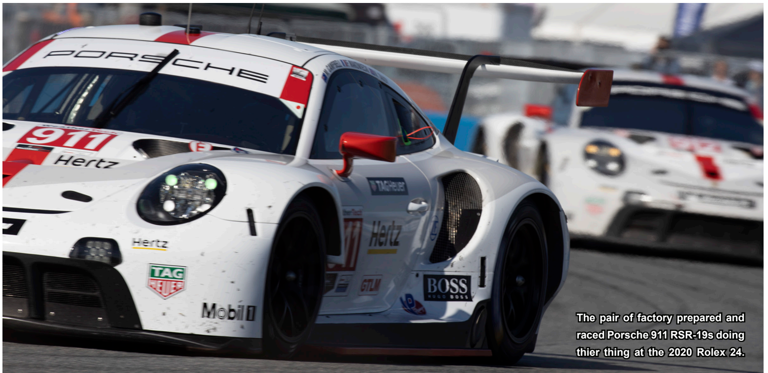
The pair of factory prepared and raced Porsche 911 RSR-19s doing thier thing at the 2020 Rolex 24.