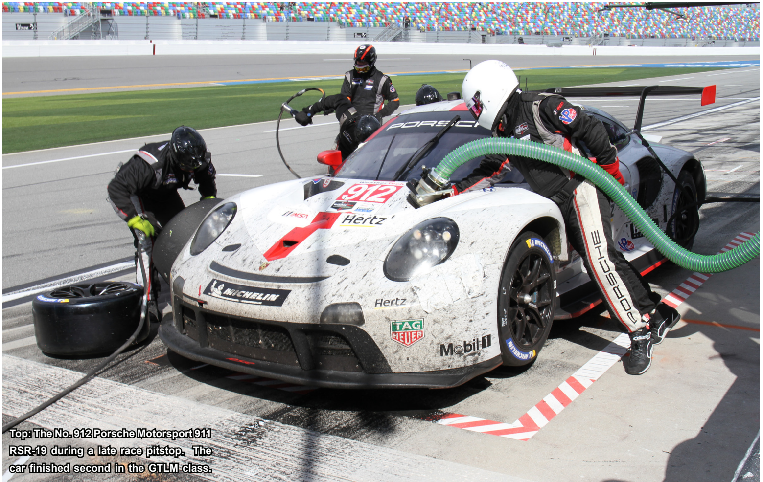
Top: The No. 912 Porsche Motorsport 911 RSR-19 during a late race pitstop. The car finished second in the GTLM class.

double podium finish at Daytona. After a strong team effort, the two 515-hp RSR-19s finished the GTLM class in second and third-place. From start to finish, the factory GT racers ran like clockwork at their first 24-hour race. Not a single technical problem hampered the premiere as the two new 911 RSR-19 race machines took turns in the lead over most of the record distance. After 786 laps, Porsche was just shy of claiming a record-extending victory at the 24-hour classic.