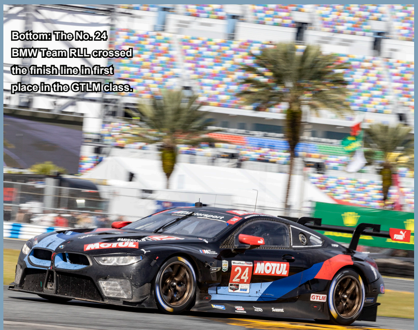
Bottom: The No. 24 BMW Team RLL crossed the finish line in first place in the GTLM class.

The new Porsche 911 RSR-19 celebrated a successful North American race debut with a