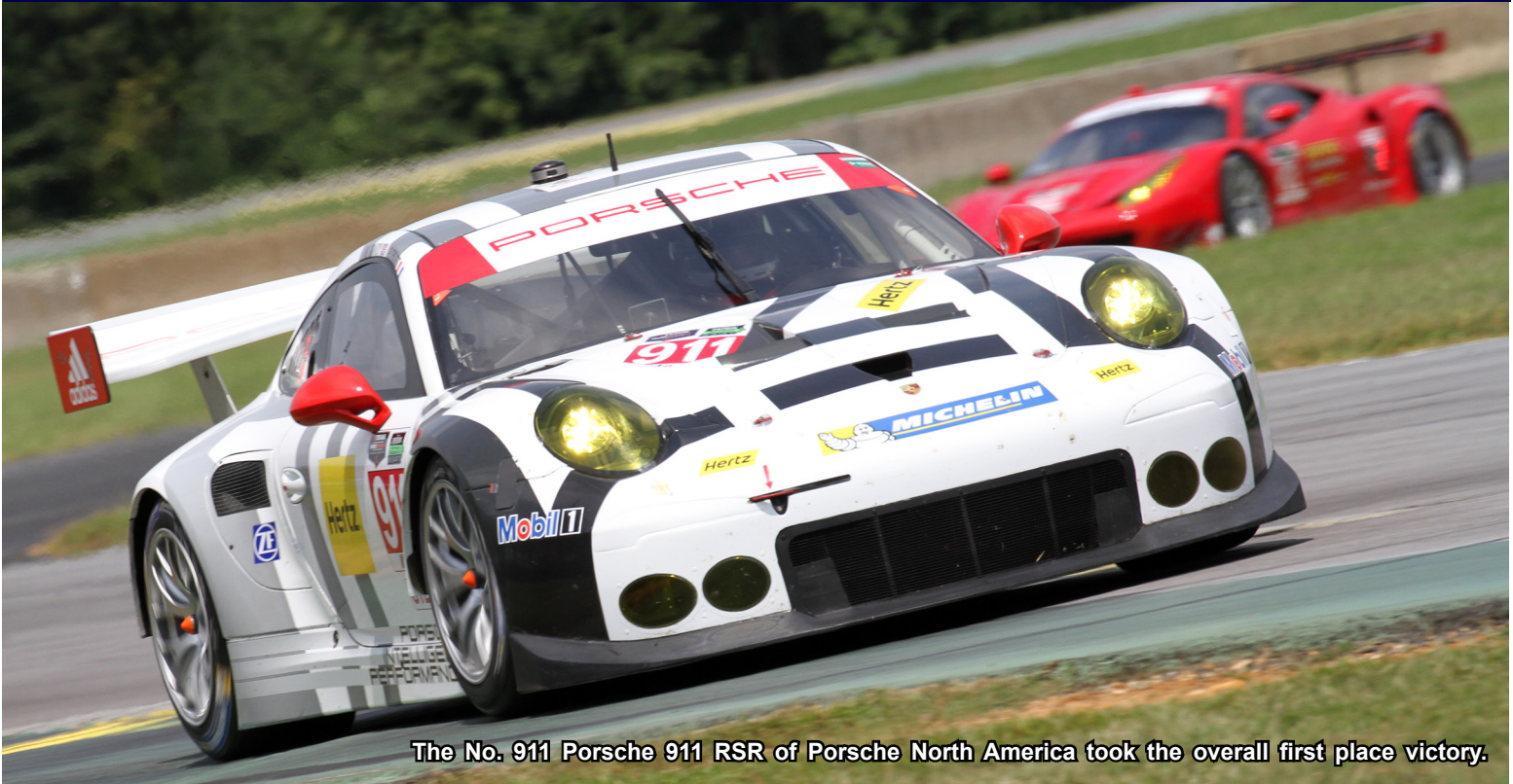
The No. 911 Porsche 911 RSR of Porsche North America took the overall first place victory.