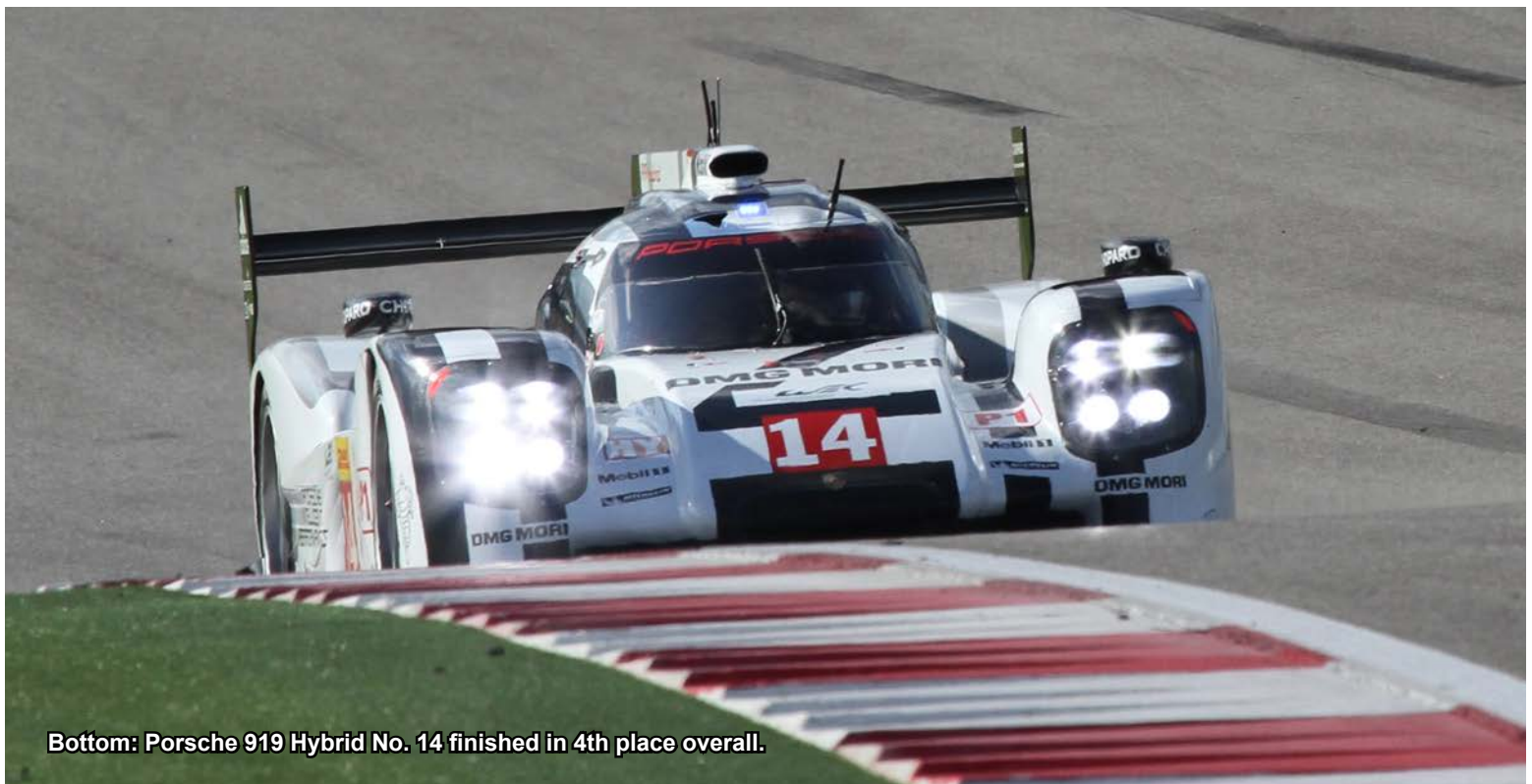
Bottom: Porsche 919 Hybrid No. 14 finished in 4th place overall.

“It was super to take over the Porsche 919 Hybrid as the leading car. After my