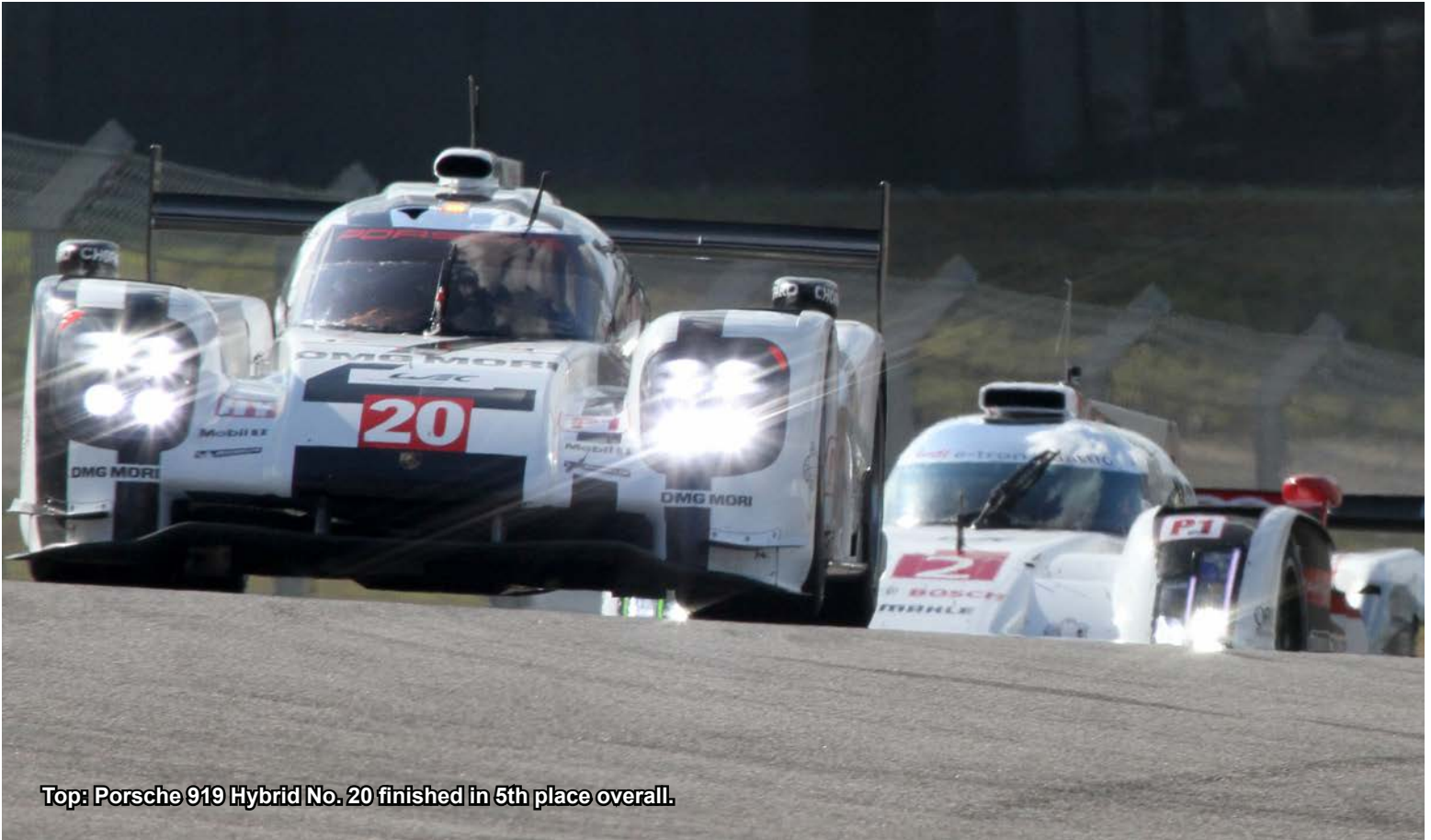
Top: Porsche 919 Hybrid No. 20 finished in 5th place overall.