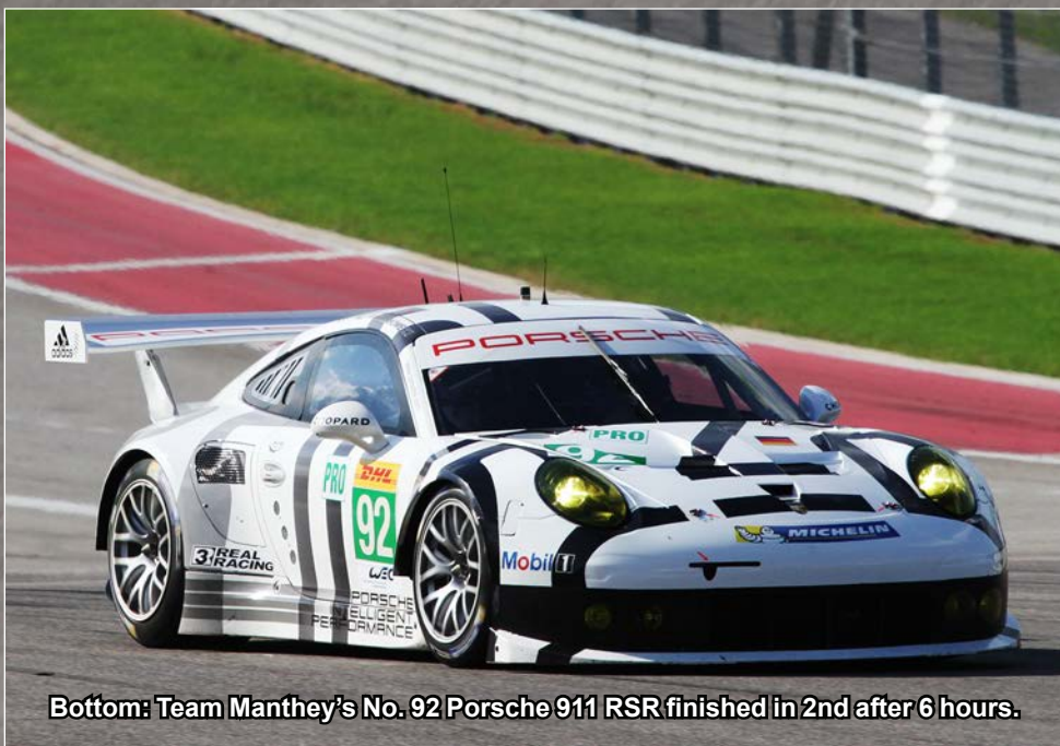
Bottom: Team Manthey's No. 92 Porsche 911 RSR finished in 2nd after 6 hours.

Austin, TX – Sept. 20, 2014 – Audi captured a definitive victory at the 2014 Six Hours of COTA giving them their second consecutive one-two finish of the FIA WEC season. The No. 2 Audi Sport Team Joest, piloted by Marcel Fassler, André Lotterer and Benoit Treluyer, took the checkered flag a mere 53 seconds ahead of the team's No. 1 car with Loïc Duval, Tom Kristensen and Lucas Di Grassi driving. The race was marked by a sudden, severe downpour about 90 minutes after the start. The "sheet of rain" effect caused nearly a dozen racecars to spin out, including many front-runners.