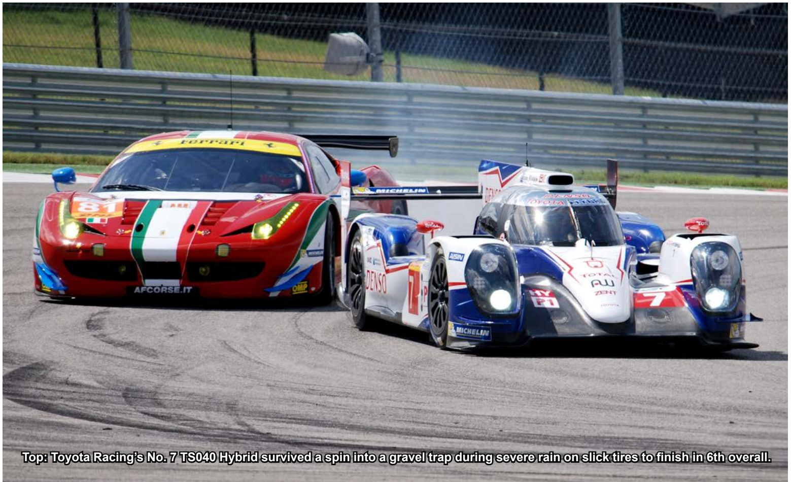
Top: Toyota Racing's No. 7 TS040 Hybrid survived a spin into a gravel trap during severe rain on slick tires to finish in 6th overall.