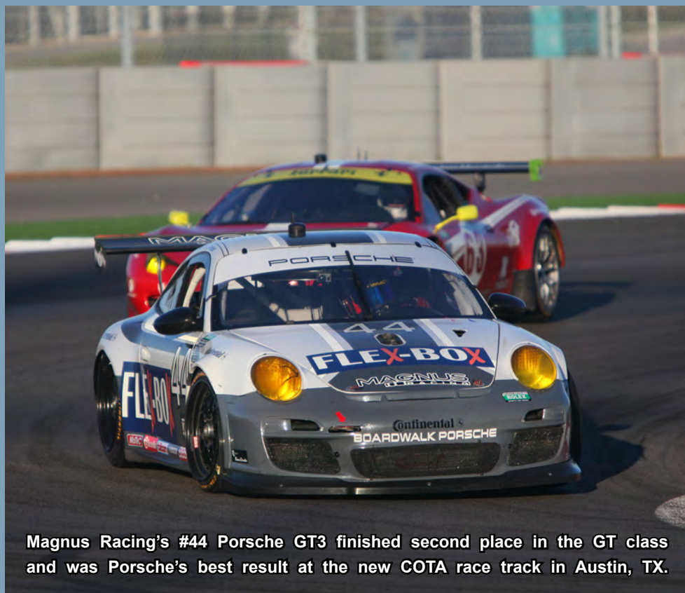
Magnus Racing's #44 Porsche GT3 finished second place in the GT class and was Porsche's best result at the new COTA race track in Austin, TX.

Austin, TX – March 2nd, 2013 – On the 175th anniversary of the Texas Independence Day, the inaugural GRAND-AM of the Americas promised Texas-sized excitement as the GRAND-AM Rolex Sports Car Series came to the new Circuit of the Americas (COTA) in Austin on March 2. Fans at the 3.4-mile, 20-turn road course were not disappointed during the two-hour and 45-minute race. Porsche customer teams performed admirably at the track with Magnus Racing finishing second in GT class followed by BruMos Racing in third. Texas owned Park Place Motorsports was awarded fourth with its No. 73 and sixth with its No. 72. The No. 18 of Muehlner Motorsports gave Porsche its fifth car in the top-10 with a ninth-place result.