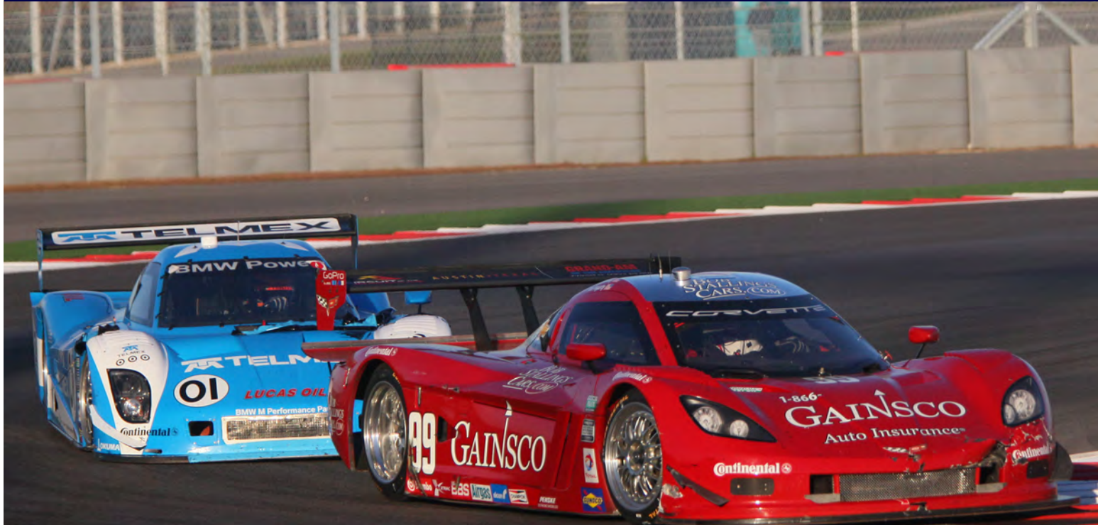
The #99 Corvette DP of GAINSCO Racing took the overall first place victory.